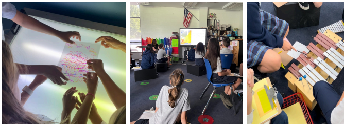
Art and Music Class: Kadinsky's art and love for music!